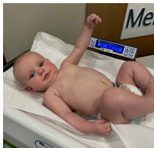
A digital scale made possible by Gala donors, will touch the lives of all babies at Mercy Hospital Washington.