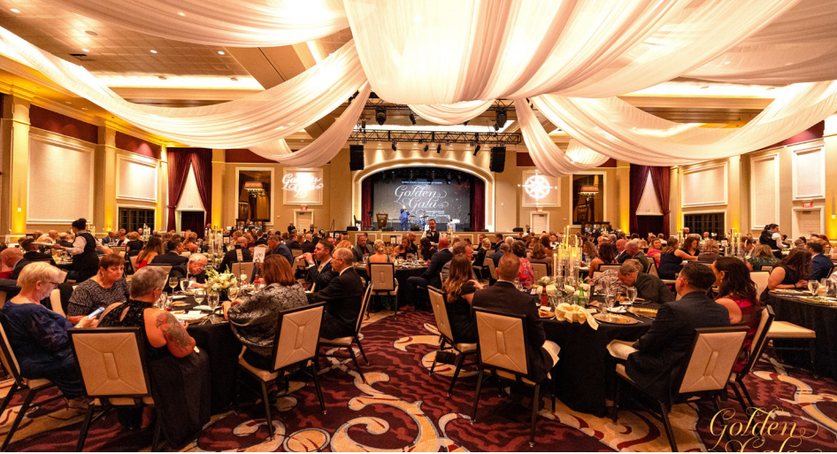
Guests enjoy a seated dinner and presentations during the Golden Gala at River City Casino