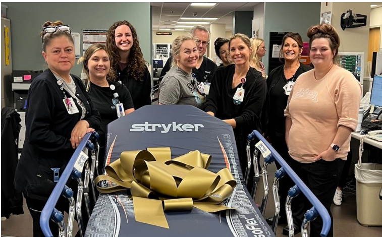
WWAM helped fund a new OB/GYN stretcher at Mercy Hospital Jefferson