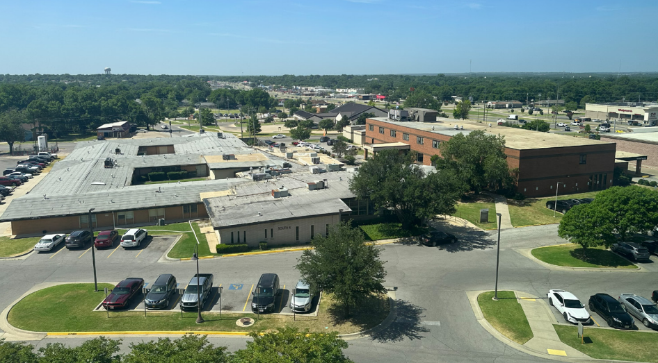
Current Outpatient Facility located South of Mercy Hospital Ardmore's Main Campus