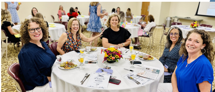
WWAM members enjoy the first Allocation Meeting for Ardmore's WWAM chapter.

The Leapfrog hospital survey evaluates established standards of care for hospital performance, including infection rates, practices for safer surgery, maternity care and medication error prevention.