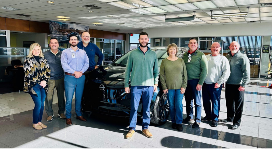
Mercy Hospital Ada receives an electric vehicle from Ada Nissan